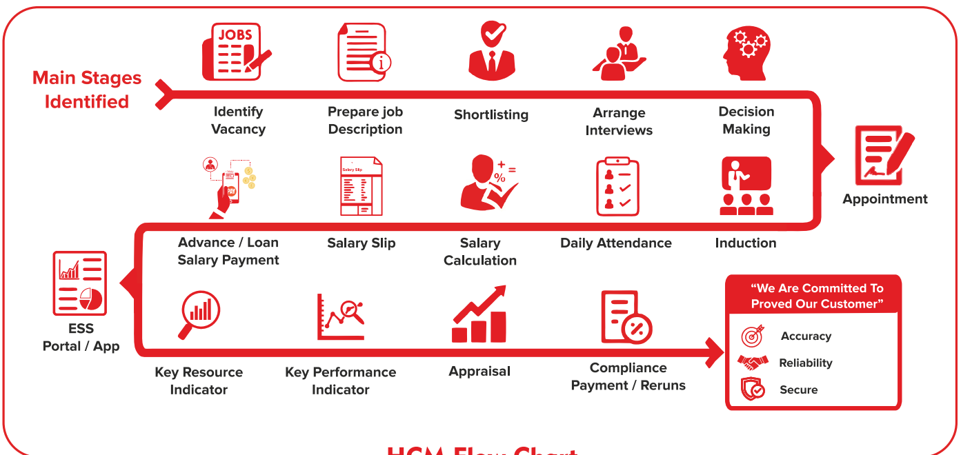
HCM Flow Chart